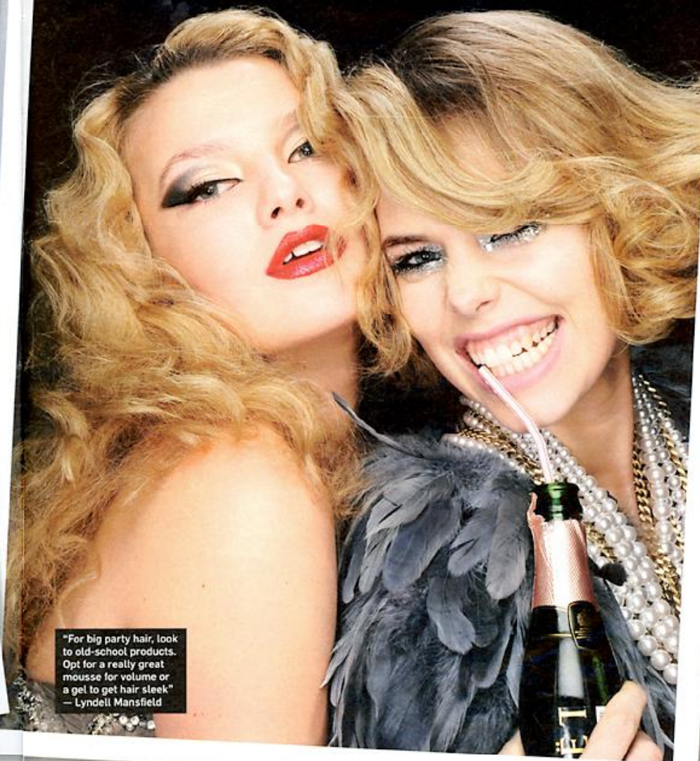
"For big party hair, look to old-school products. Opt for a really great mousse for volume or a gel to get hair sleek" — Lyndell Mansfield

WANT A PICTURE-PERFECT PARTY LOOK? OUR EXPERTS HAVE THE TIPS